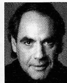
ROBERT KLEIN NOVEMBER 10 THE LEGENDARY COMEDIAN RETURNS FOR ONE NIGHT ONLY!!