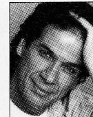
BOBBY COLLINS NOVEMBER 24 FROM VH-1'S "STAND-UP SPOTLIGHT"