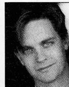
JIM BREUER NOVEMBER 11-14 FROM "SATURDAY NIGHT LIVE" AND MTV'S "THE JIM BREUER SHOW"