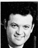
PAUL RODRIGUEZ NOVEMBER 4-6 FROM HBO, COMIC RELIEF AND THE FILMS "D.C. CAB" "BORN IN EAST L.A.," AND "MADE IN AMERICA"