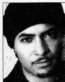
SHANG NOVEMBER 4-7 FROM "POLITICALLY INCORRECT" AND RUSSELL SIMMONS' "ONE WORLD MUSIC BEAT"