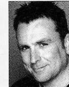
COLIN QUINN THANKSGIVING WEEKEND NOVEMBER 25-28 FROM NBC-TV'S "SATURDAY NIGHT LIVE"