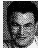
ROBERT WUHL NOVEMBER 19-21 THE STAR OF HBO'S "ARLISS" AND FROM THE FILMS "BATMAN" AND "GOOD MORNING VIETNAM"